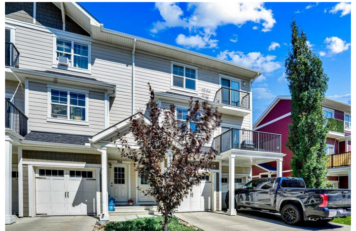
707-881 Sage Valley Blvd NW, Calgary, AB

Main Building: Total Exterior Area Above Grade 1202.39 sq ft