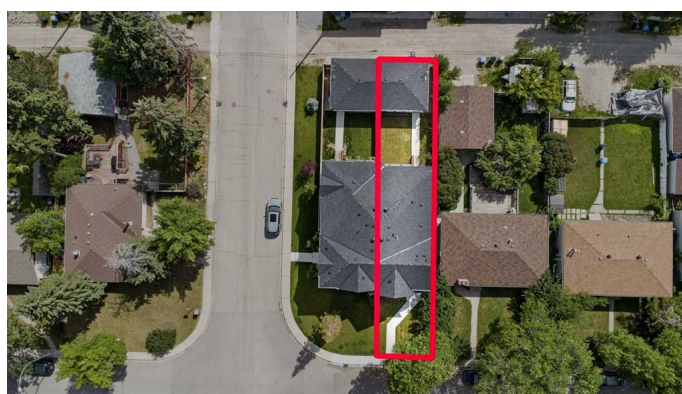
3704 42 St SW, Calgary, AB

Main Floor Exterior Area 942.00 sq ft Interior Area 896.04 sq ft