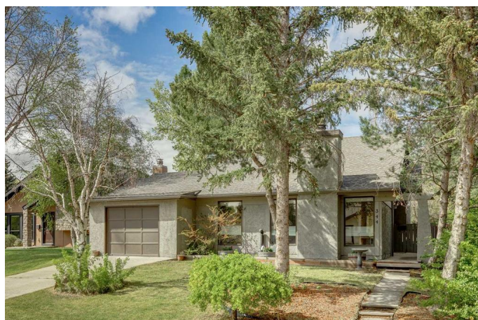
344 Oakwood Pl SW, Calgary, AB

2nd Floor Main Exterior Area 586.69 sq ft Interior Area 540.09 sq ft Excluded Area 323.52 sq ft