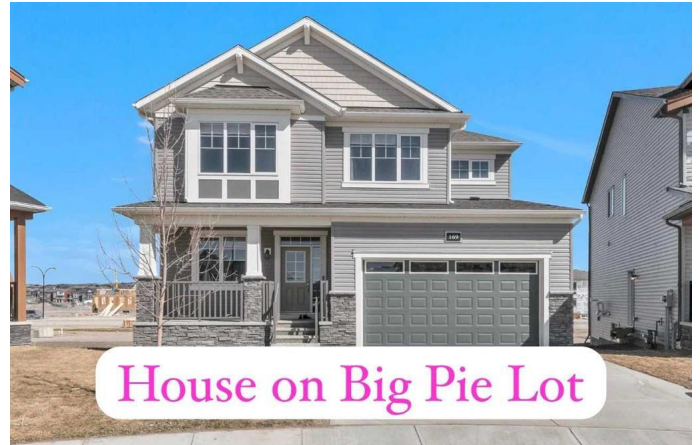
House on Big Pie Lot

Check out this stunning 2-storey detached home in the vibrant community of Carrington. Situated on a huge pie lot with no back-facing neighbours. This one-year-old home offers 3 bedrooms plus a den, 2.5 bathrooms, and a double-attached garage. Thoughtfully designed, it offers loads of upgrades (over $100,000) and is ideal for families and professionals alike. The open-concept layout features high-end engineered hardwood throughout the main level and 2nd floor, a show-stopping great room with soaring ceilings, expansive windows that fill the space with natural light, and a raised gas fireplace. The dining area flows effortlessly into the chef-inspired kitchen, complete with quartz countertops, upgraded cabinets with a lazy Susan and pot & pan drawers, a large island with breakfast bar, kitchen backsplash, SS chimney hood fan, and a corner pantry offering ample storage. The main floor office/den is great for working from home. A 2-pc bathroom on the main floor adds functionality. Upstairs, there are 9' ceilings throughout. The primary bedroom provides a relaxing retreat with a spacious walk-in closet and a 4-pc ensuite. The 2nd and 3rd bedrooms are bright and generously sized, each with its own walk-in closet, and are complemented by a full 4-pc bath. All bathrooms feature full-height mirrors, quartz countertops, and stylish backsplash details. A bright and airy loft adds flexibility as a second family lounge or playroom, while the laundry room with rough-in for sink adds