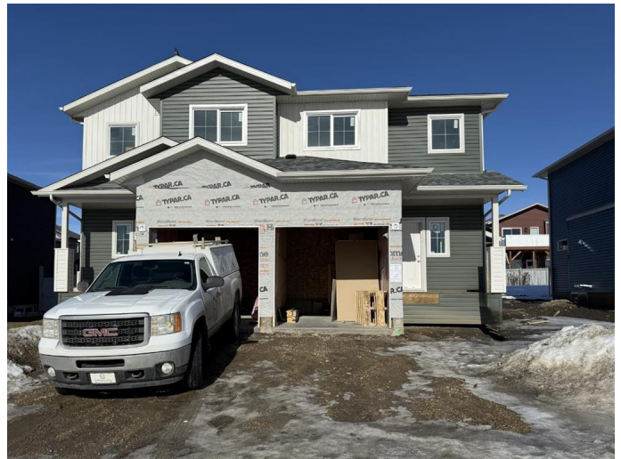
The Oxford II Duplex Unit with basement suite 1,337 s.f./ 1,316 s.f.