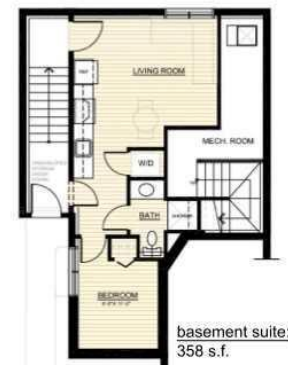
basement suite: 358 s.f.